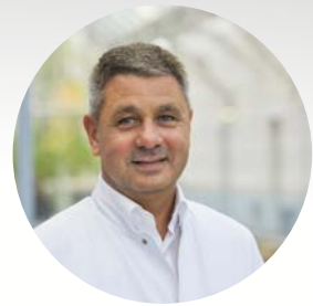
Assist. Prof. Dr.

Consultant Orthopaedic Surgeon Royal Orthopaedic Hospital NHS Foundation Trust Birmingham, UK